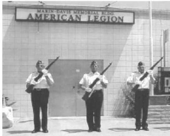
Marin-Davis Memorial Building