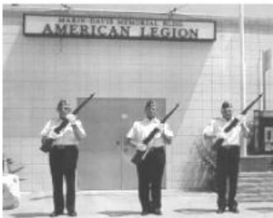
Marin-Davis Memorial Building